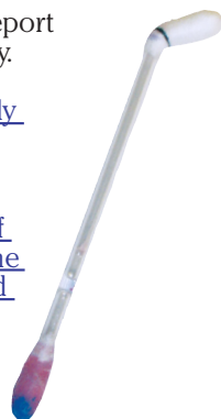
Top is Freeport's old swab. Bottom is new Lynn Peavey swab.

To clear our (perfectly good) inventory we have decided to run a 50% off sale. While supplies last, boxes of 50 QuickCheck Cocaine Swabs are now marked down from $30 to just $15! Just enter coupon code SWAB617 .