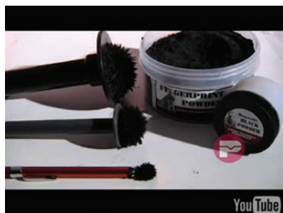
Sample shots from CSI Basics.com